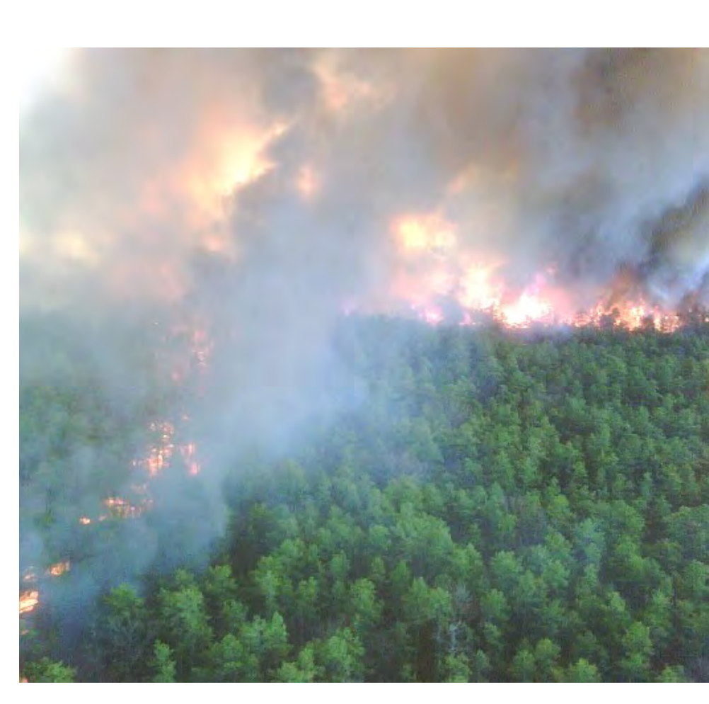
March 2010 Paramount Fire in Barnegat Township.